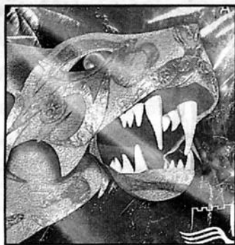
THIS YEAR: A Bengal tiger tale